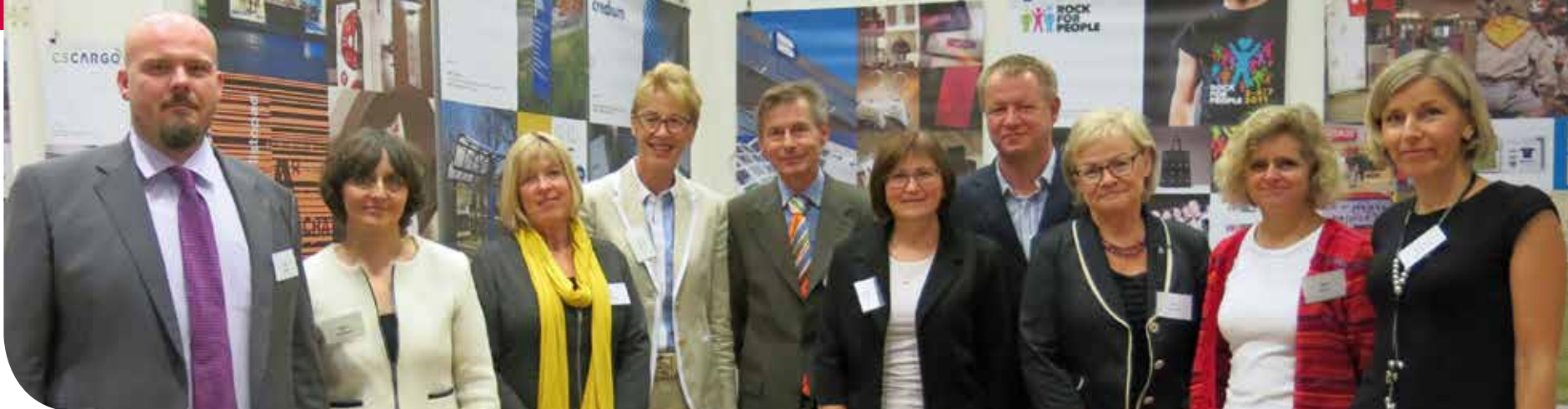
Minister of Health, Norwegian Ambassador and Project Partners at Final Project Conference in Prague